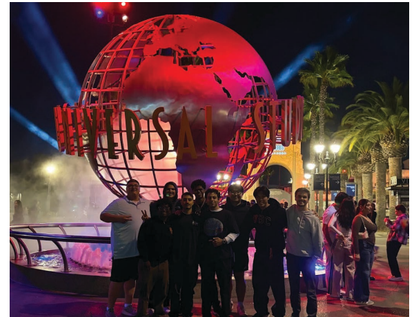
Our first brotherhood event at Universal Studios Horror Nights. Thank you, alumni!